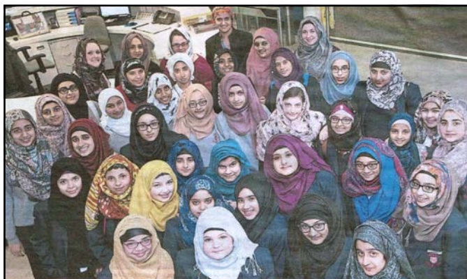
Left: Students from Pleckgate High School

Pleckgate's staff and students highlighted World Hijab's Day message of 'Better Awareness. Better Understanding, Peaceful World' with some students and staff choosing to wear head scarves as a way of understanding other people's religious choices.